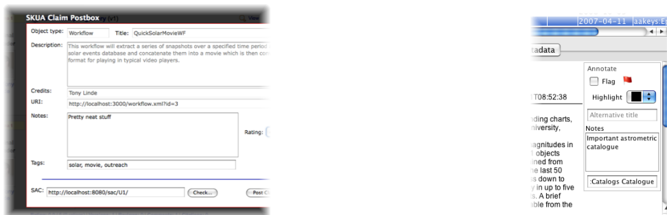
Figure 2: Annotation panels for Spacebook (left) and VOExplorer (right)