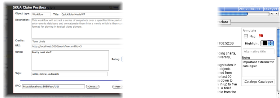
Figure 2: Annotation panels for Spacebook (left) and VOExplorer (right)